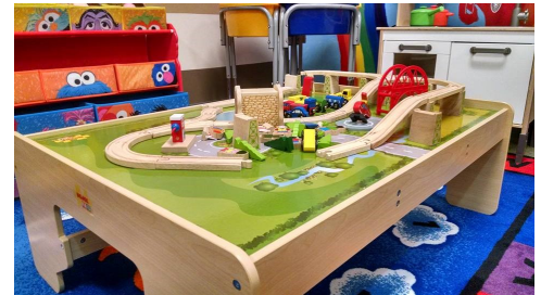
Toys & activities in the space are STEAM oriented.