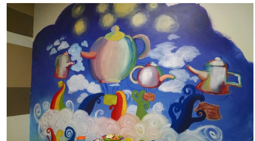
Students from the Lawrence County Career & Technical Center painted the mural.

The Kids' Corner includes a train table, kitchen area, bean bags, and more. Best for kids, ages five & under, the space is located in the library area. It offers hours of fun for youngsters, giving parents the opportunity to sip coffee with friends while sitting close by.